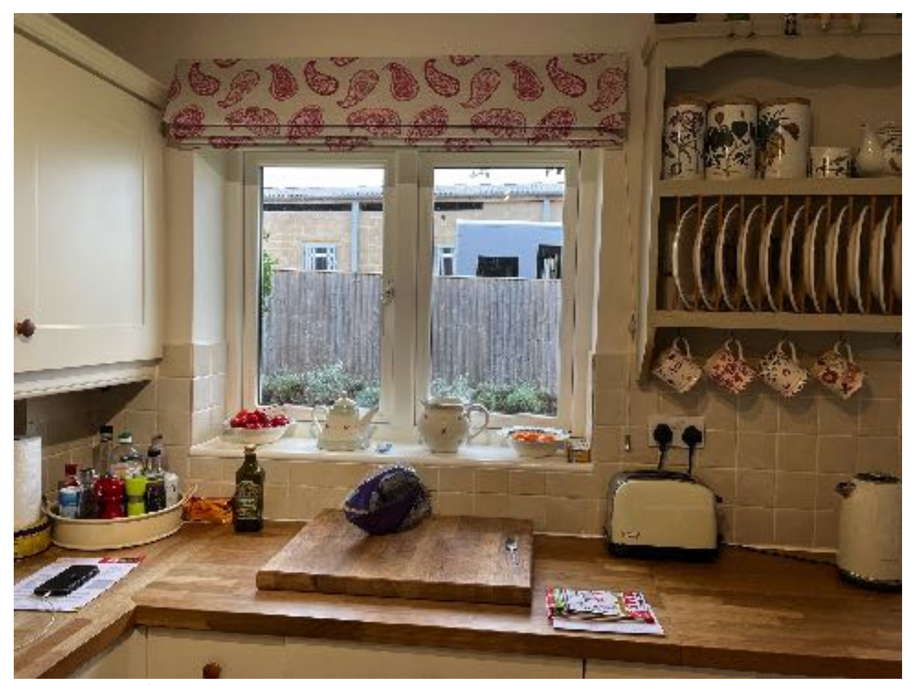
Windows from Ground Floor kitchen - horse box obscuring tack room door/ramp Windows from Ground floor Living room