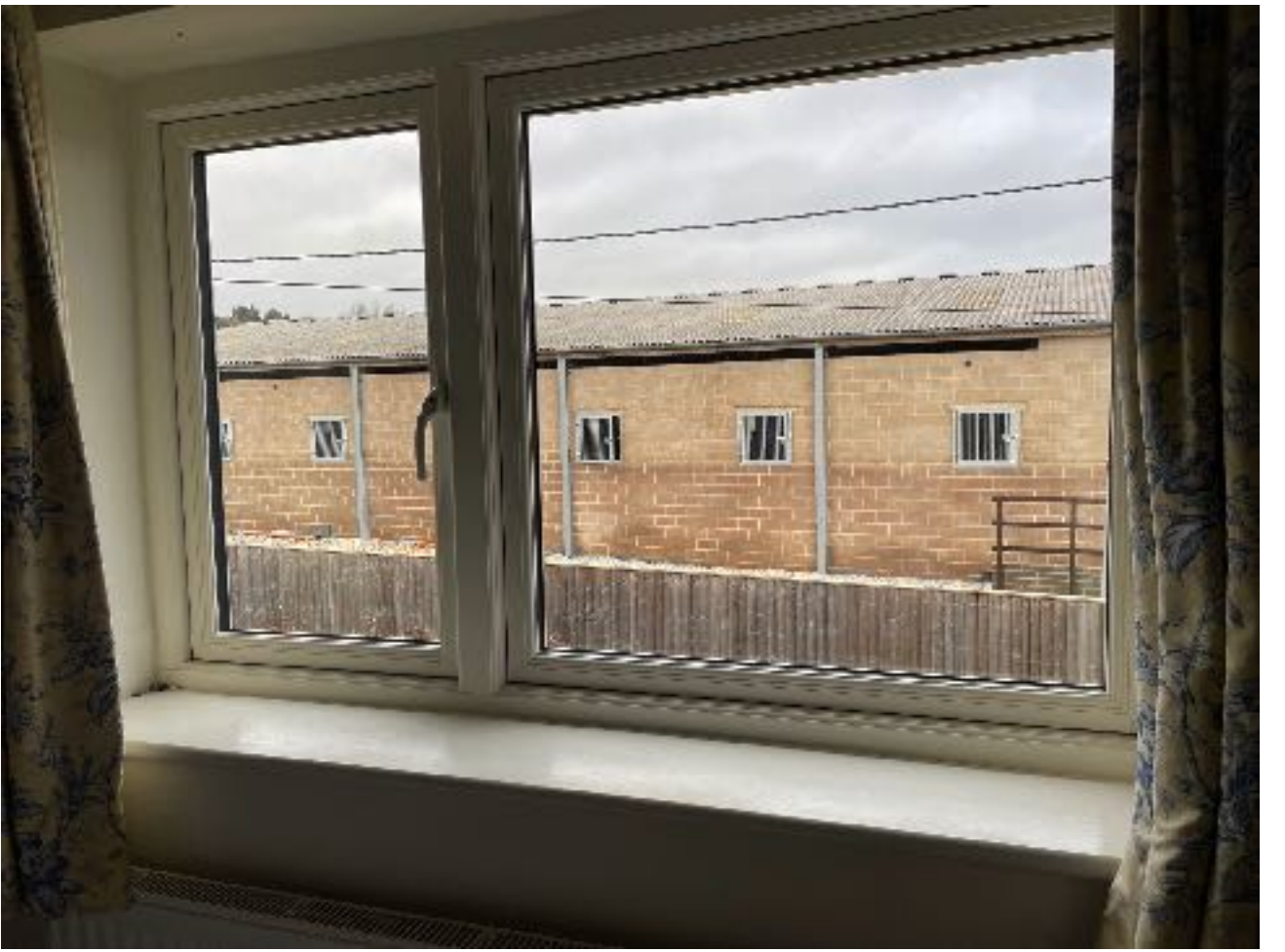
windows/tackroom ramp from first floor main bedroom