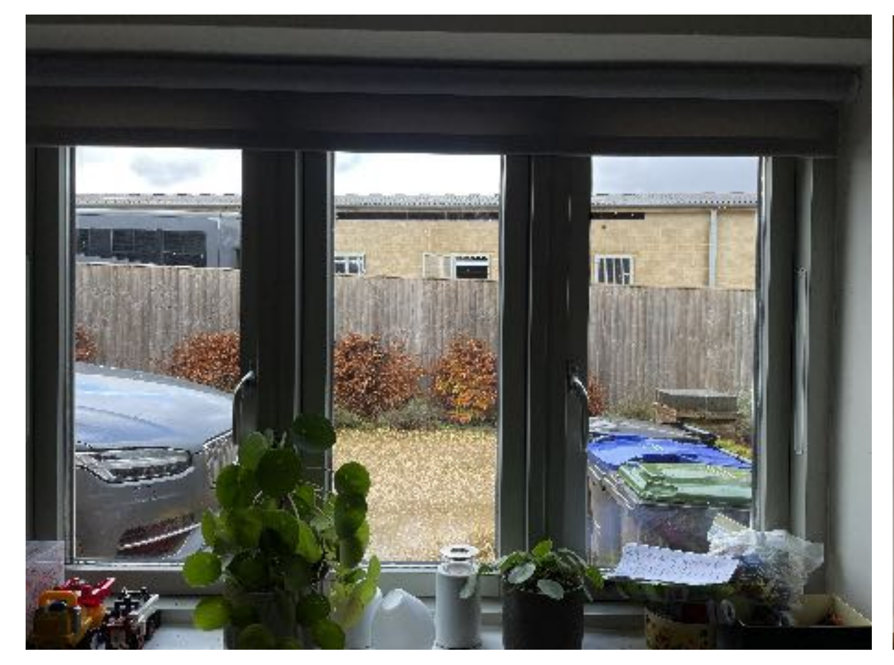
Windows from Ground Floor play room - 2 Rabley Hill Cottages