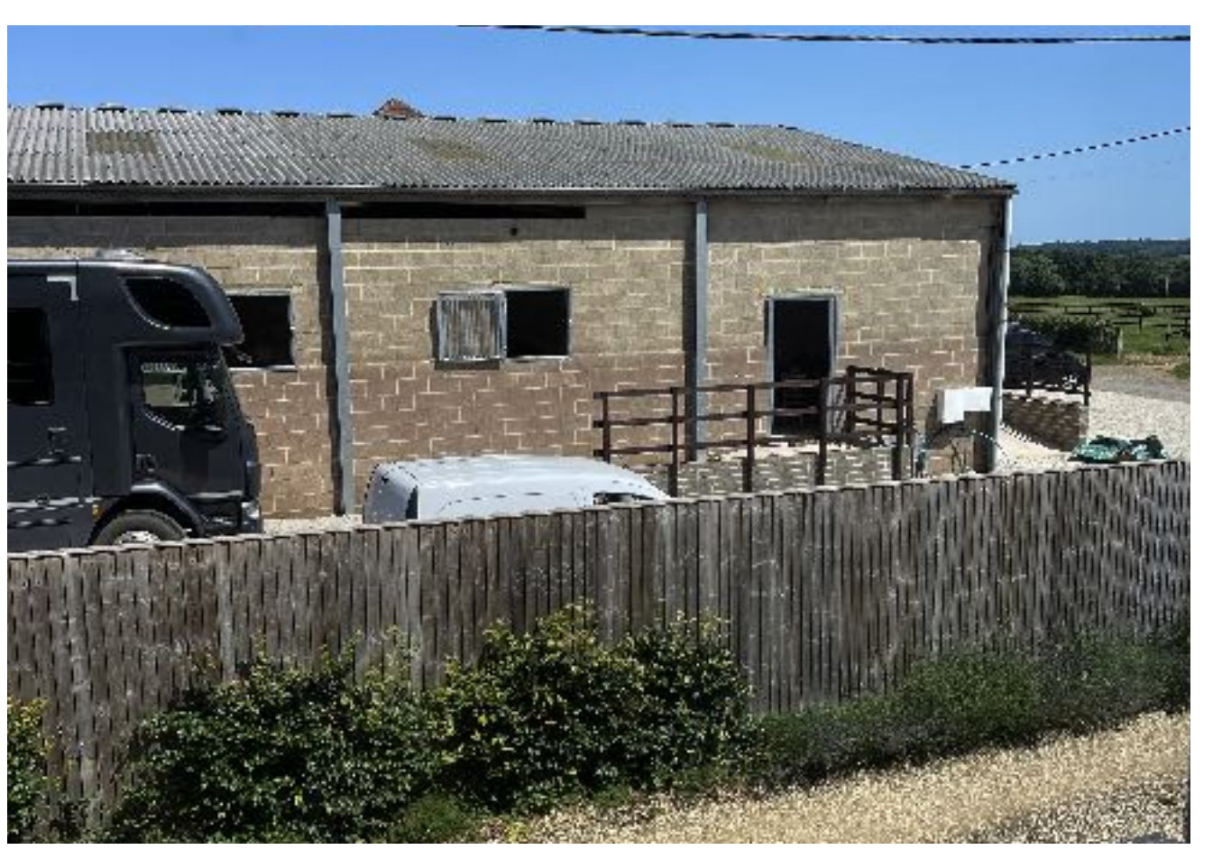
Tackroom door left open to staff socialising and viewing platform