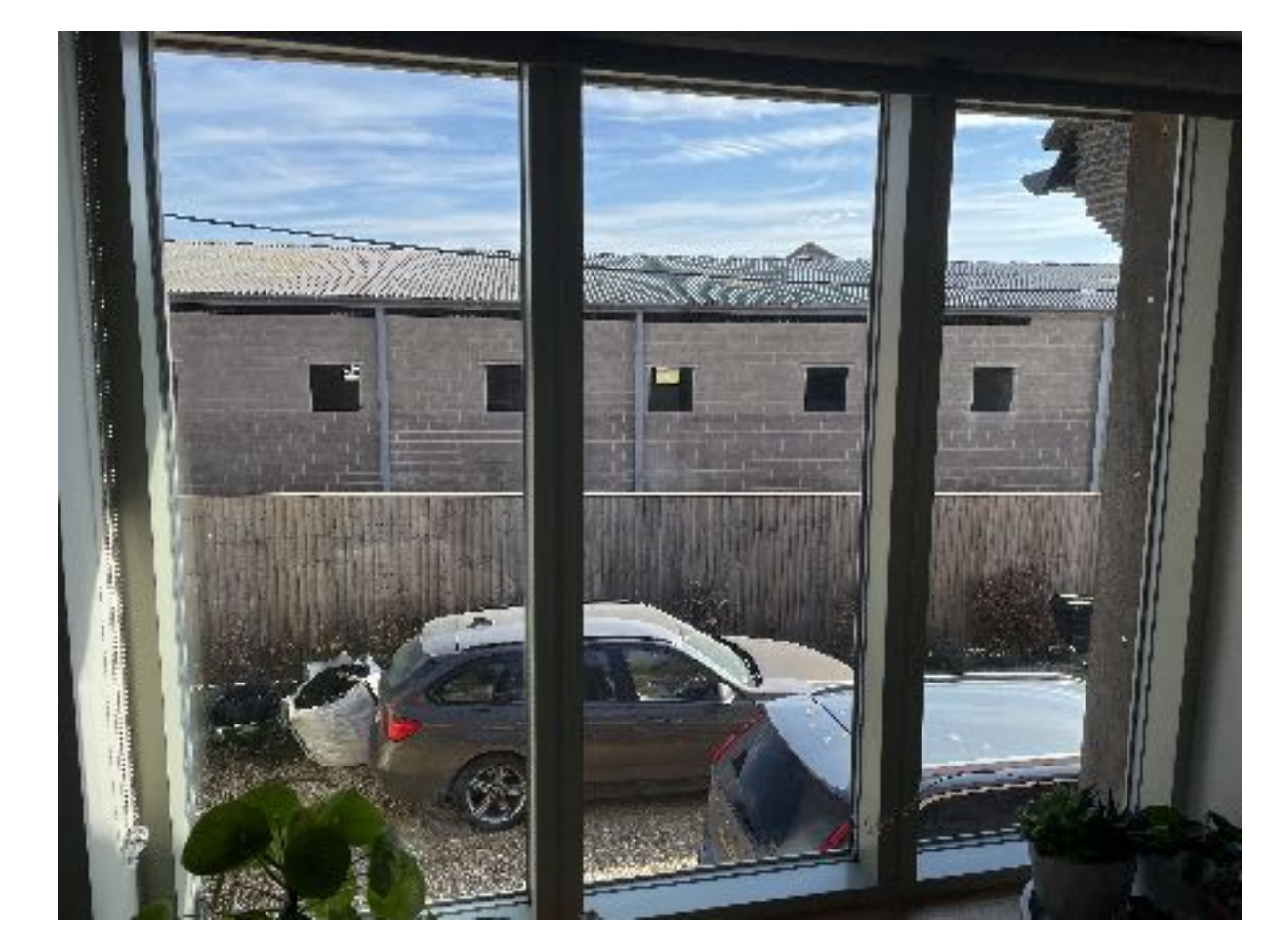
Windows from First Floor Landing