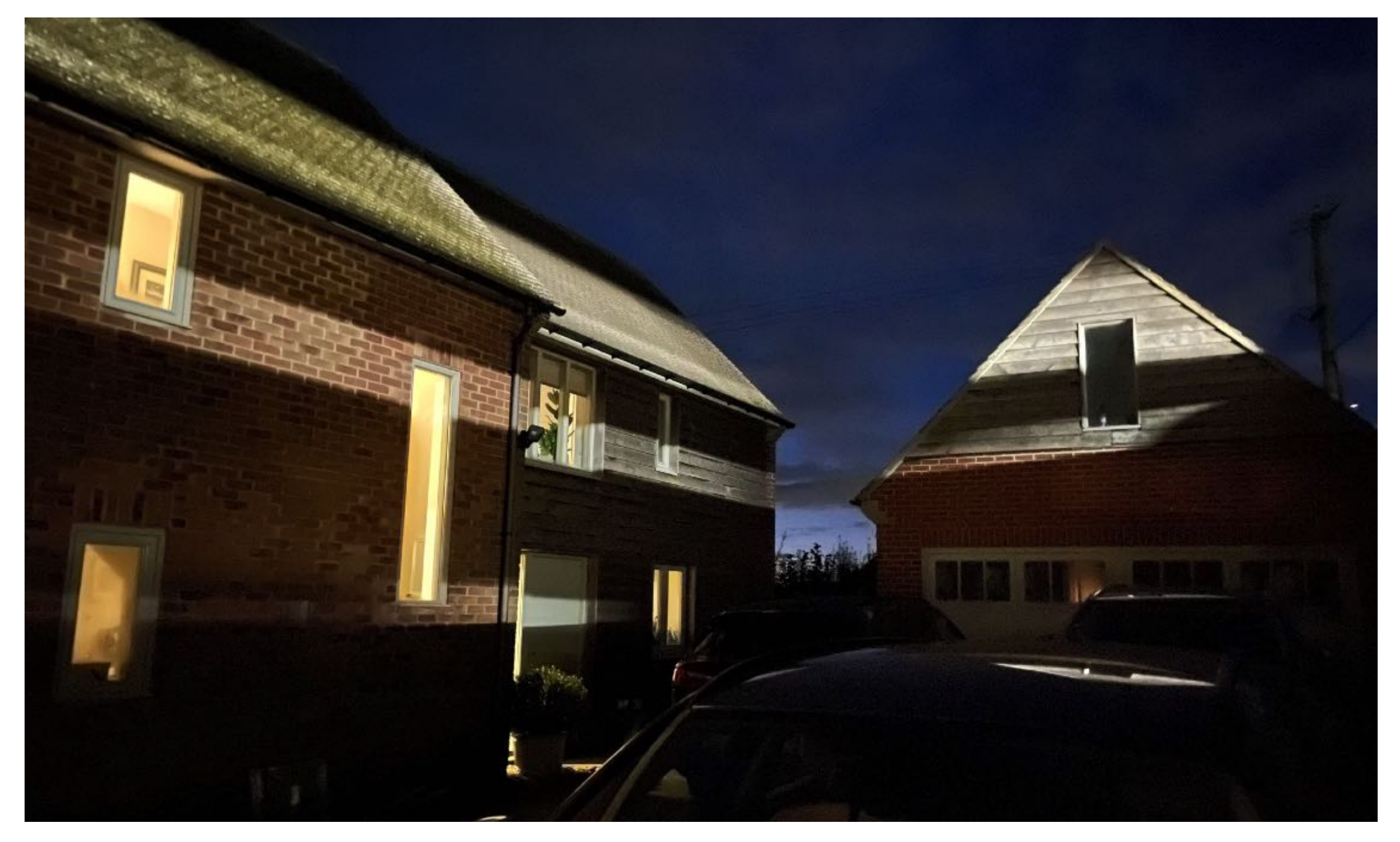
Light spill from internal lighting through open/glazed windows during winter months after dark, with 2 large 12m x 4m high horse boxes parked in front to screen. These lights are can remain on 24 hours a day.