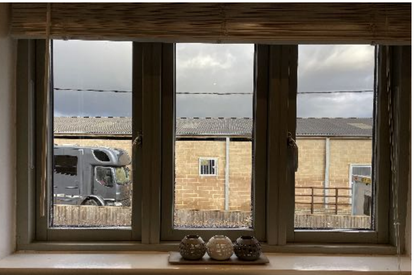
Windows from First Floor Bedroom - - 2 Rabley Hill Cottages